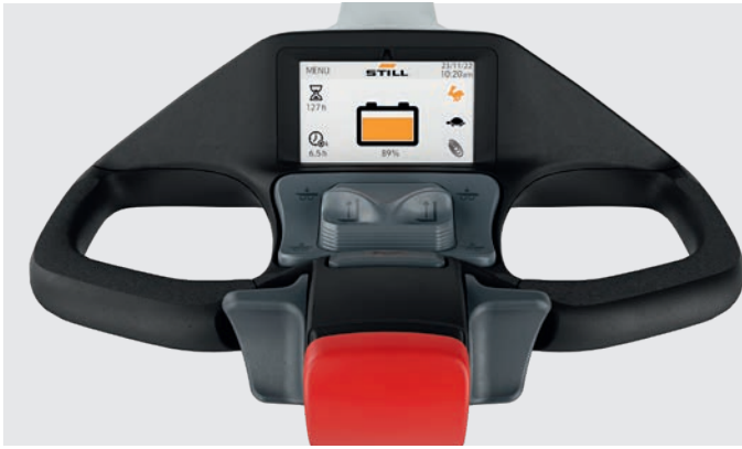
Everything in view, all the time: optional touch display with a range of language-independent symbols shows you all of the important functions at a glance