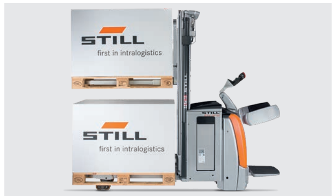
High turnover performance due to double deck transport of non-stackable goods