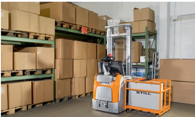
Ready at all times: high availability thanks to optional lateral battery change