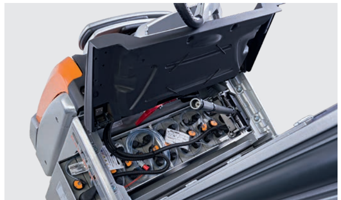
Fast and safe: innovative battery plug lock enables fast battery replacement, without the risk of jamming