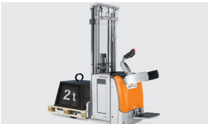
Maximum power: if the mast is not required, up to 2.0 t can be carried on the initial lift