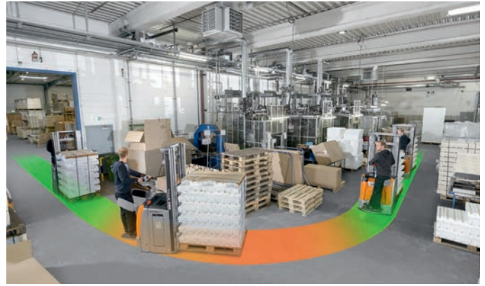
Safe even when cornering: automatic speed reduction around corners