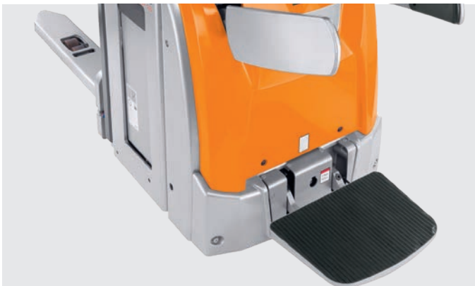
Reduces back strain: air suspended stand-on platform adjustable to the individual weight of the driver