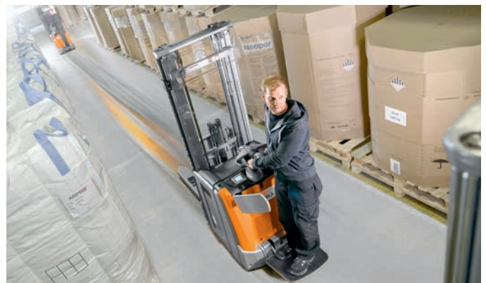
Maximum turnover performance: 10 km/h top driving speed